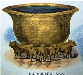
Molten Sea, illustration in the Holman Bible, 1890

It stood on twelve oxen, three facing the north, three facing west, three facing south and three facing east; and the sea was set on top of them and all their hindquarters turned inwards.