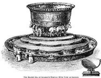
An artist's rendition of the Molten Sea